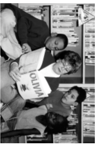
Children reading at Belmont Elementary School.

On Tuesday, September 18 th , Runza® Restaurants in Lincoln will donate a portion of sales to the Foundation for Lincoln Public Schools to provide Golden Sower books to students of all ages.